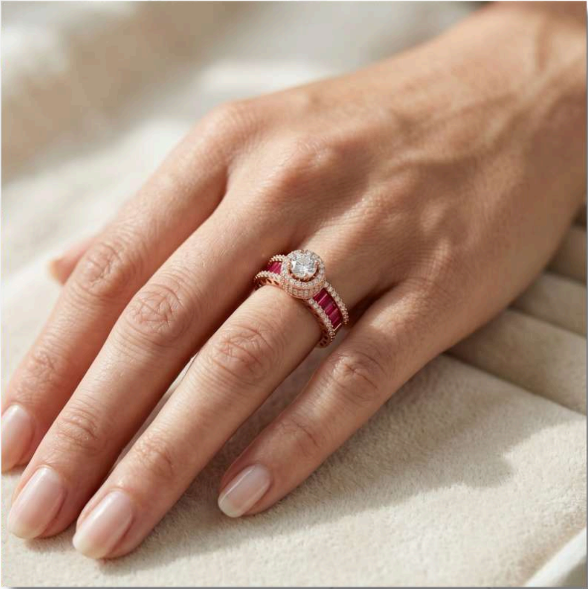
Style No. 103402B