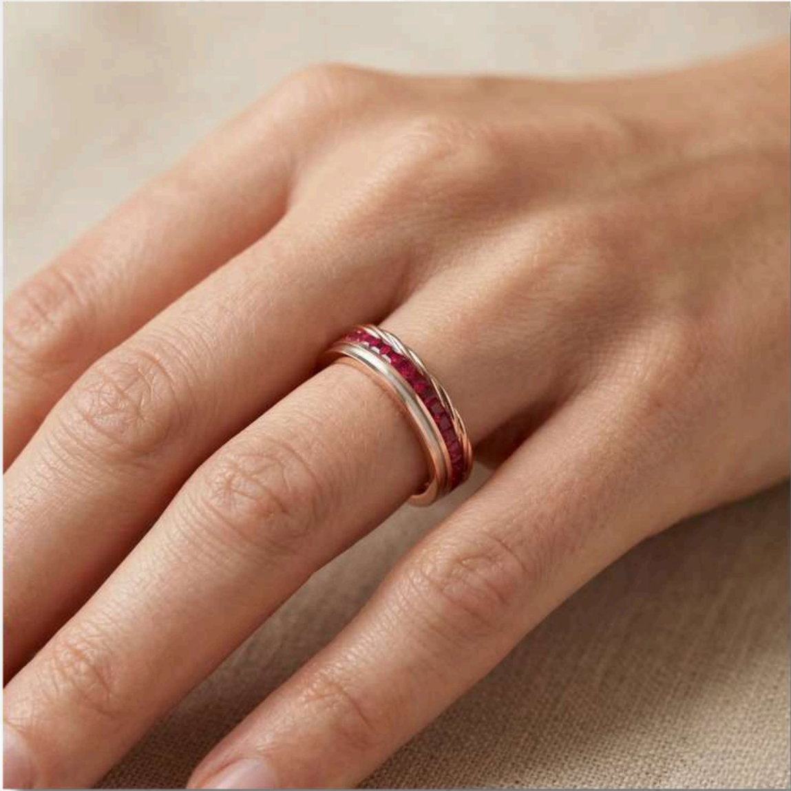
Style No. 104035C