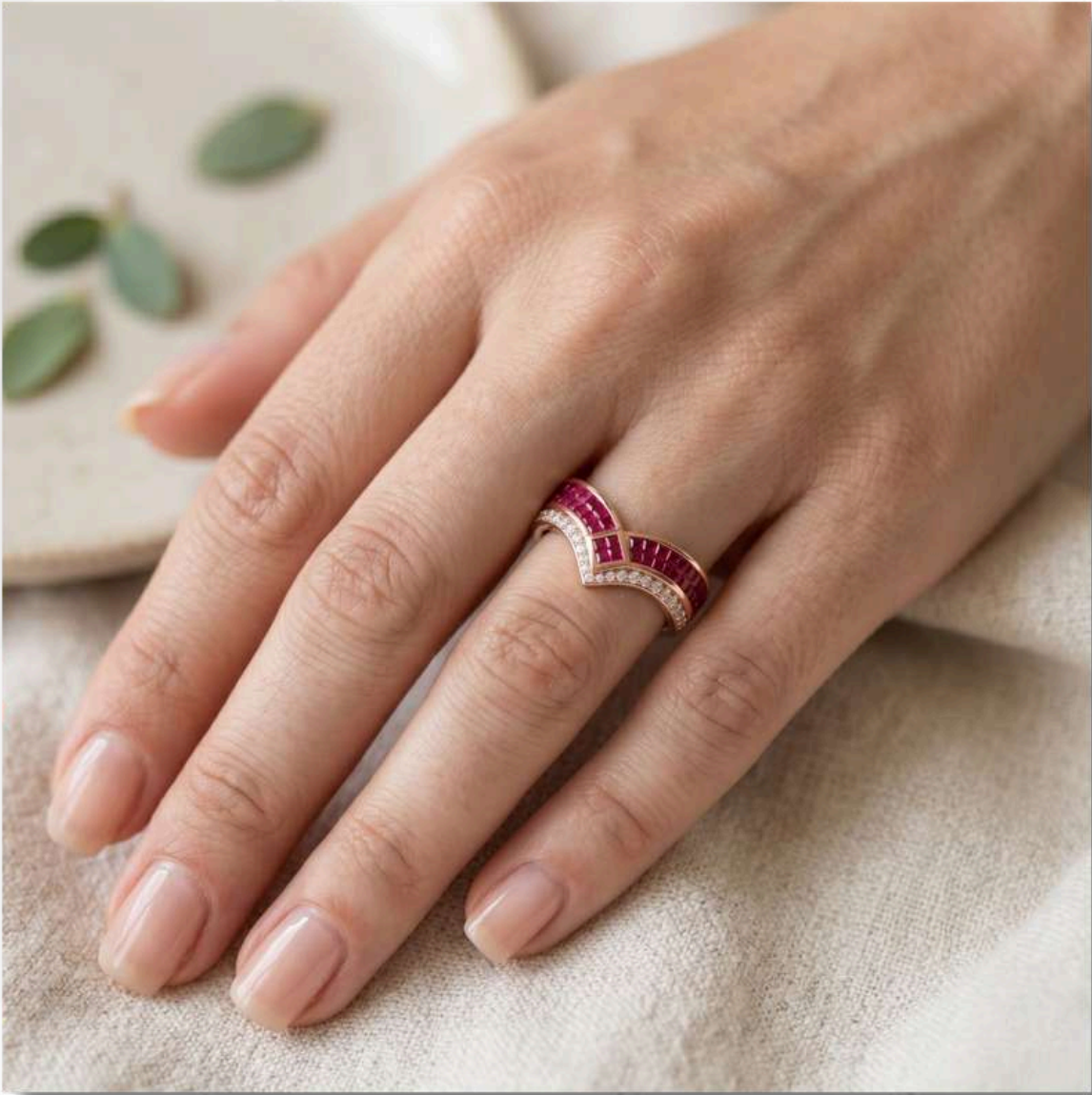
Style No. 104206