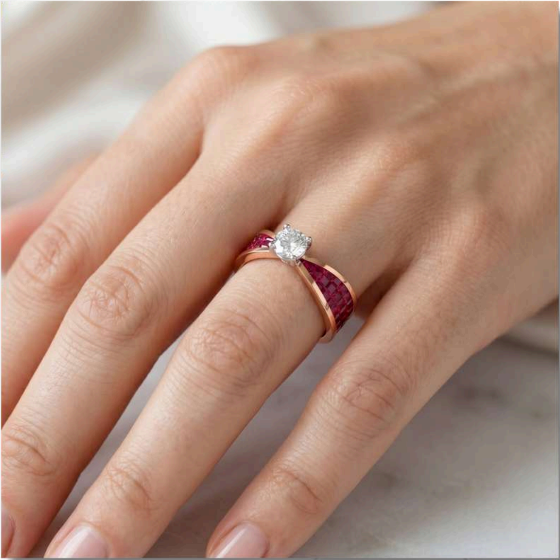
Style No. 104184