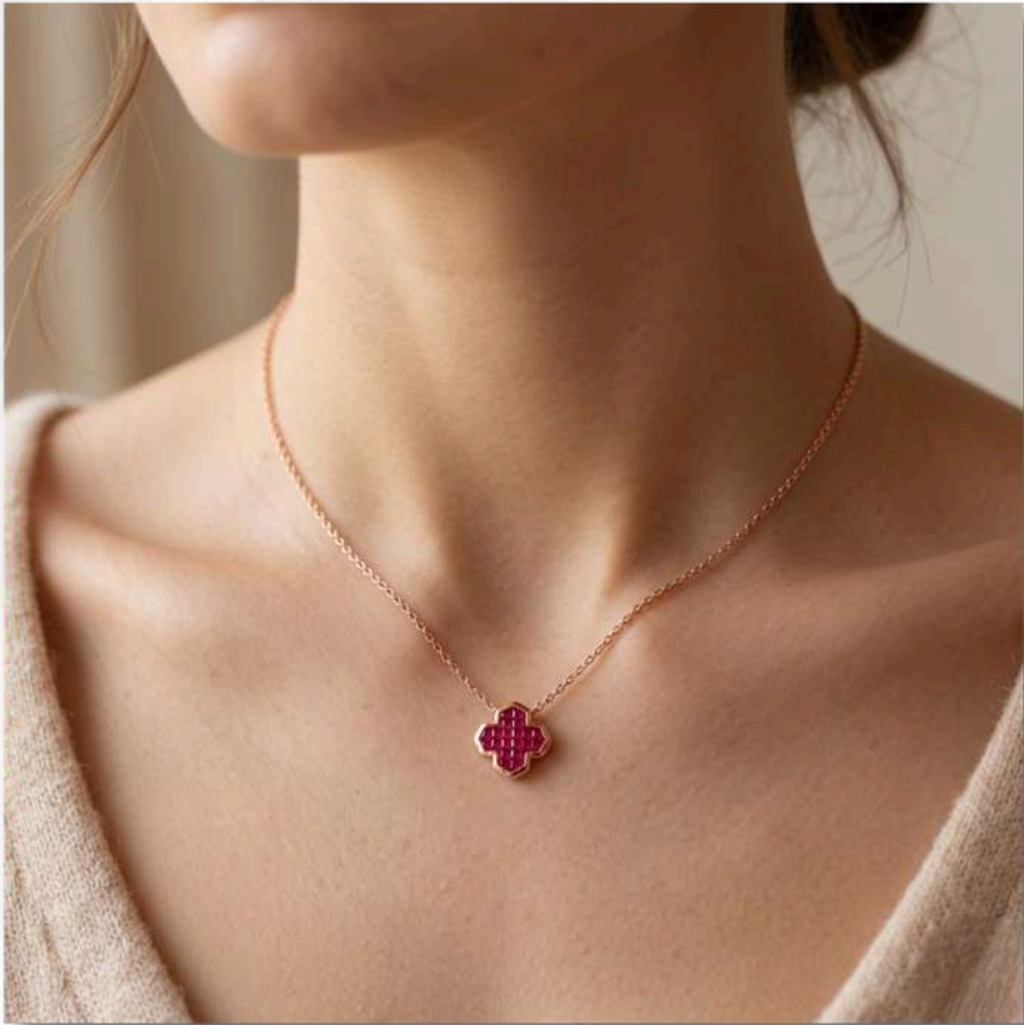
Style No. 30958