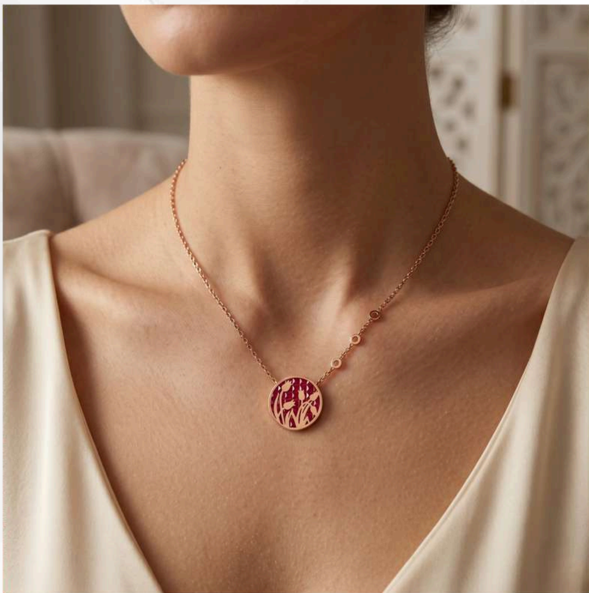
Style No. DFP-46