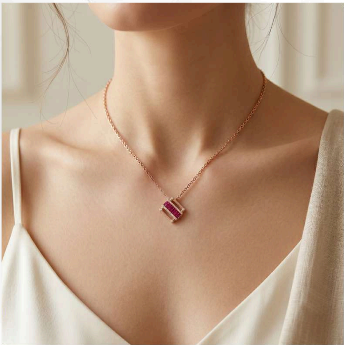
Style No. 40654