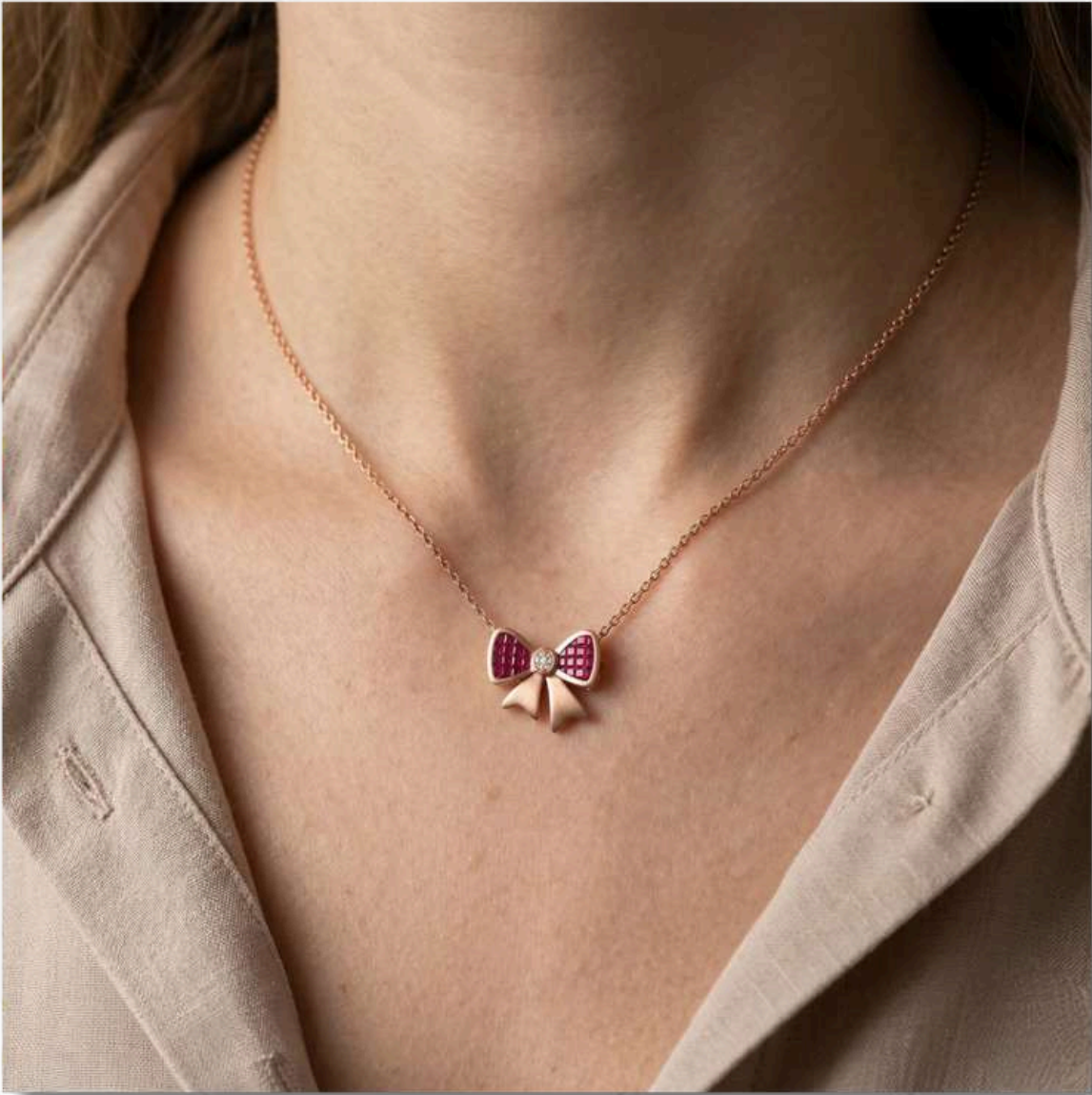
Style No. 30934A