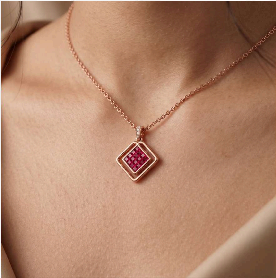
Style No. 40636