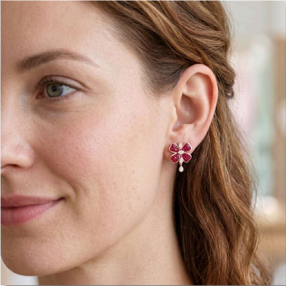
Style No. 201789