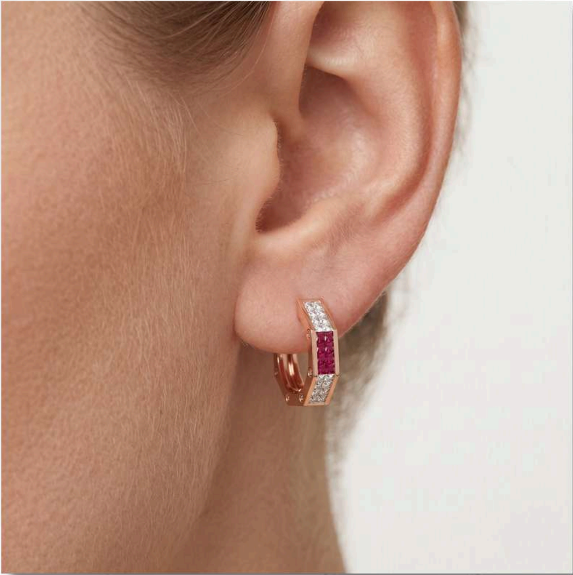
Style No. DFPSE-1