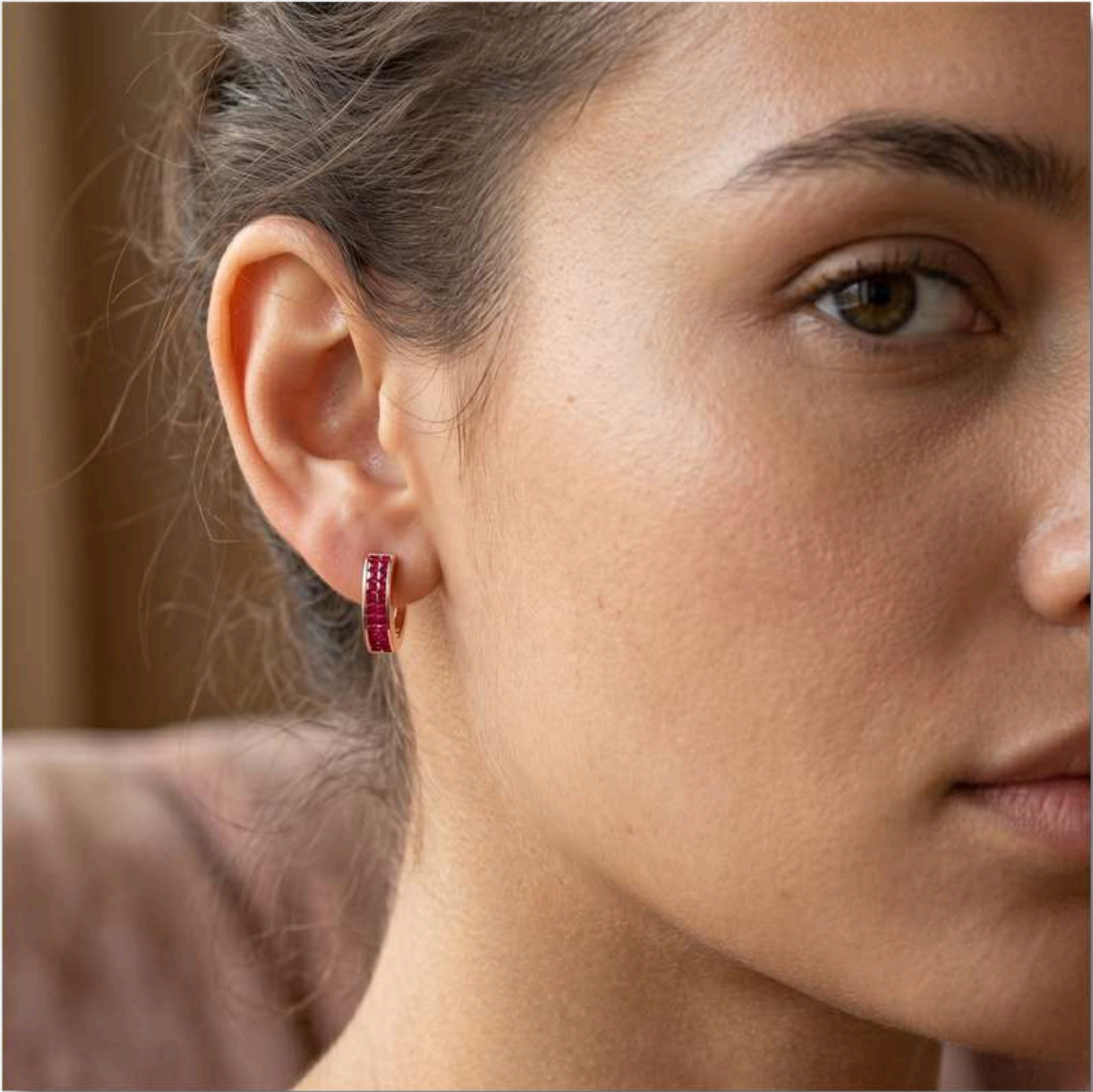
Style No. 201779