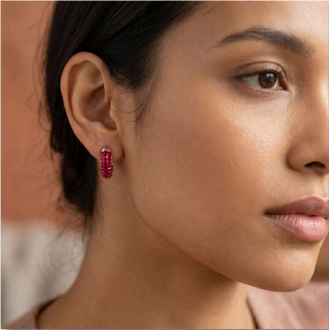
Style No. 201548A