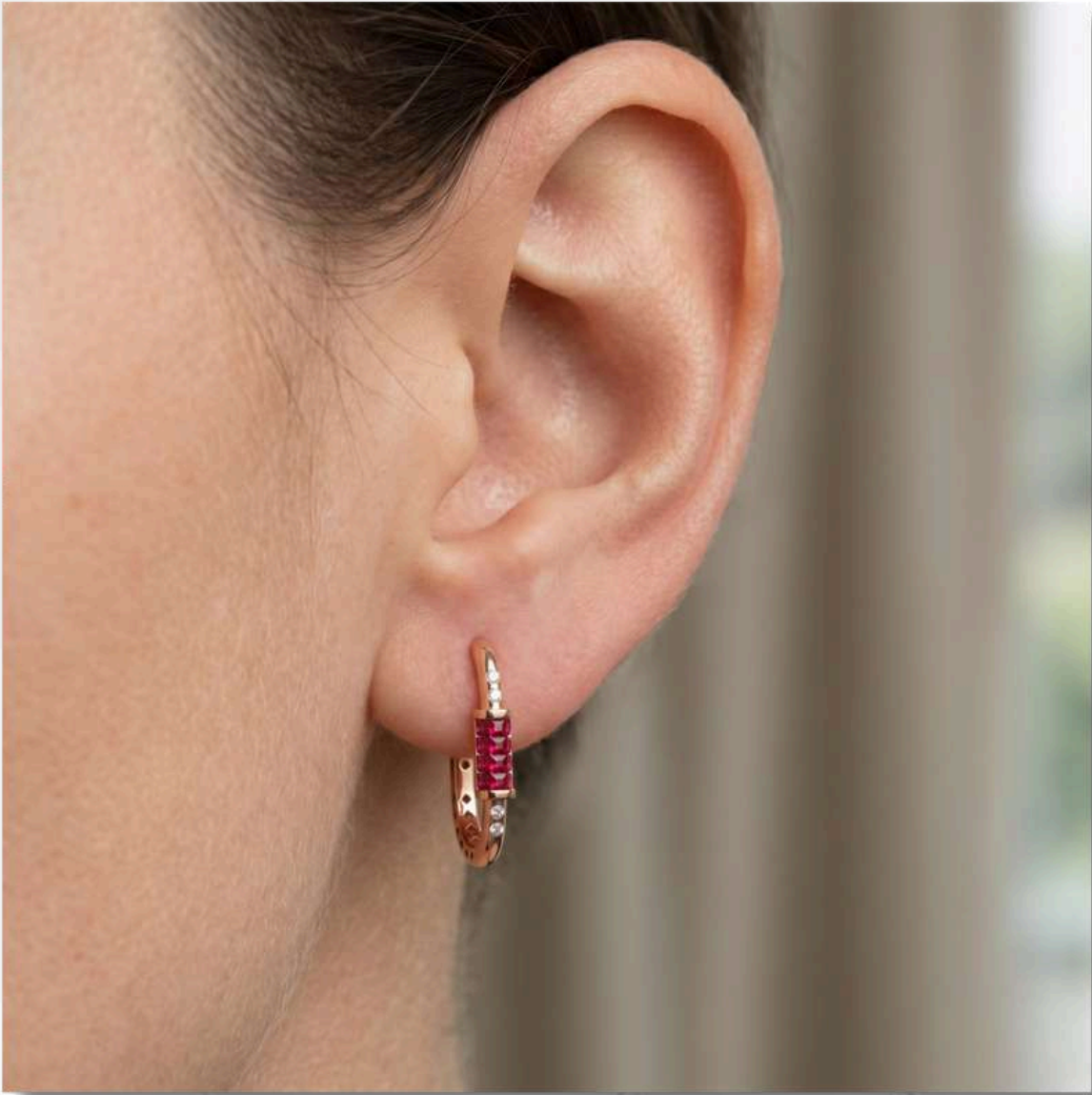
Style No. 201654A