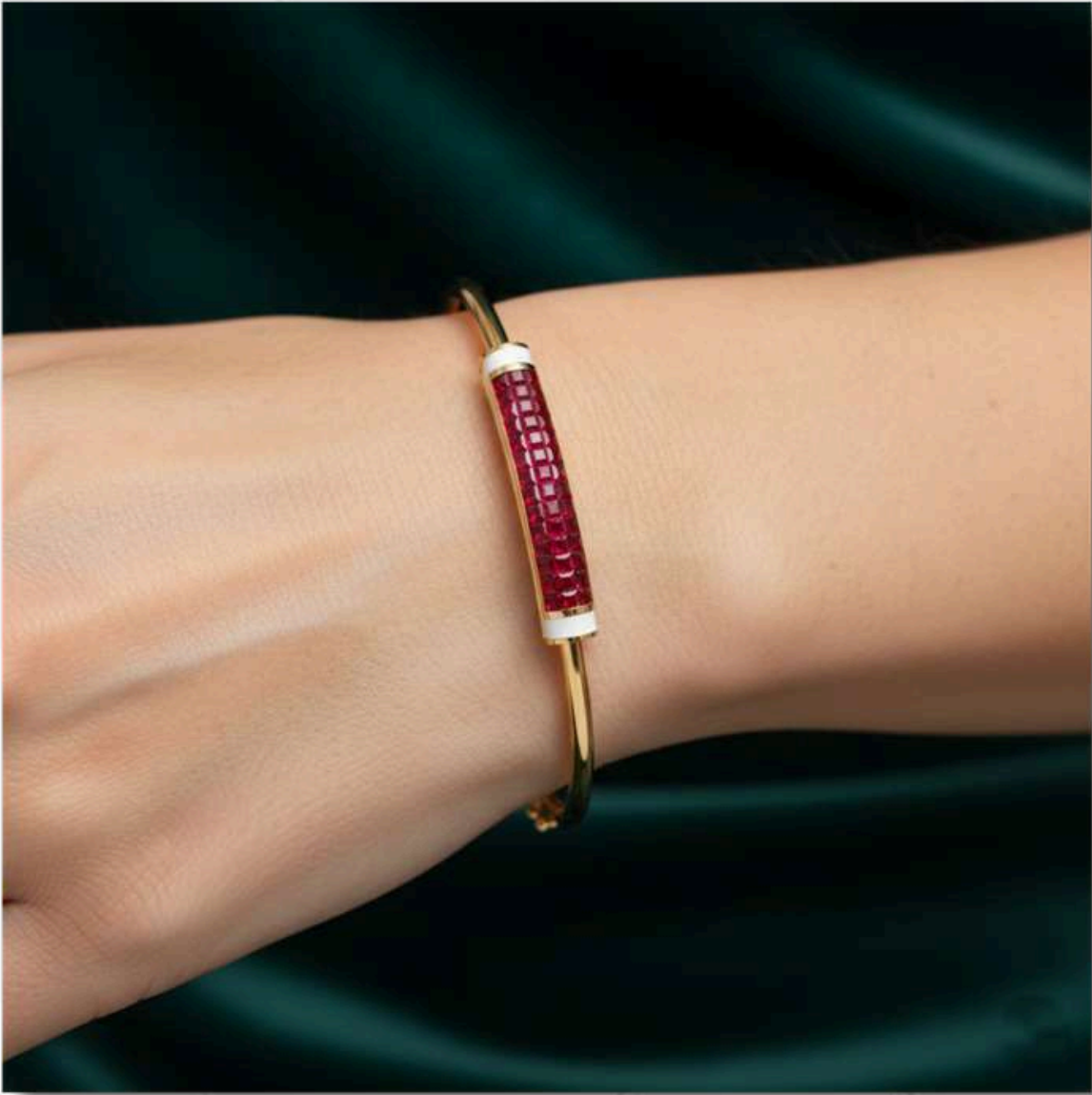
Style No. 70646