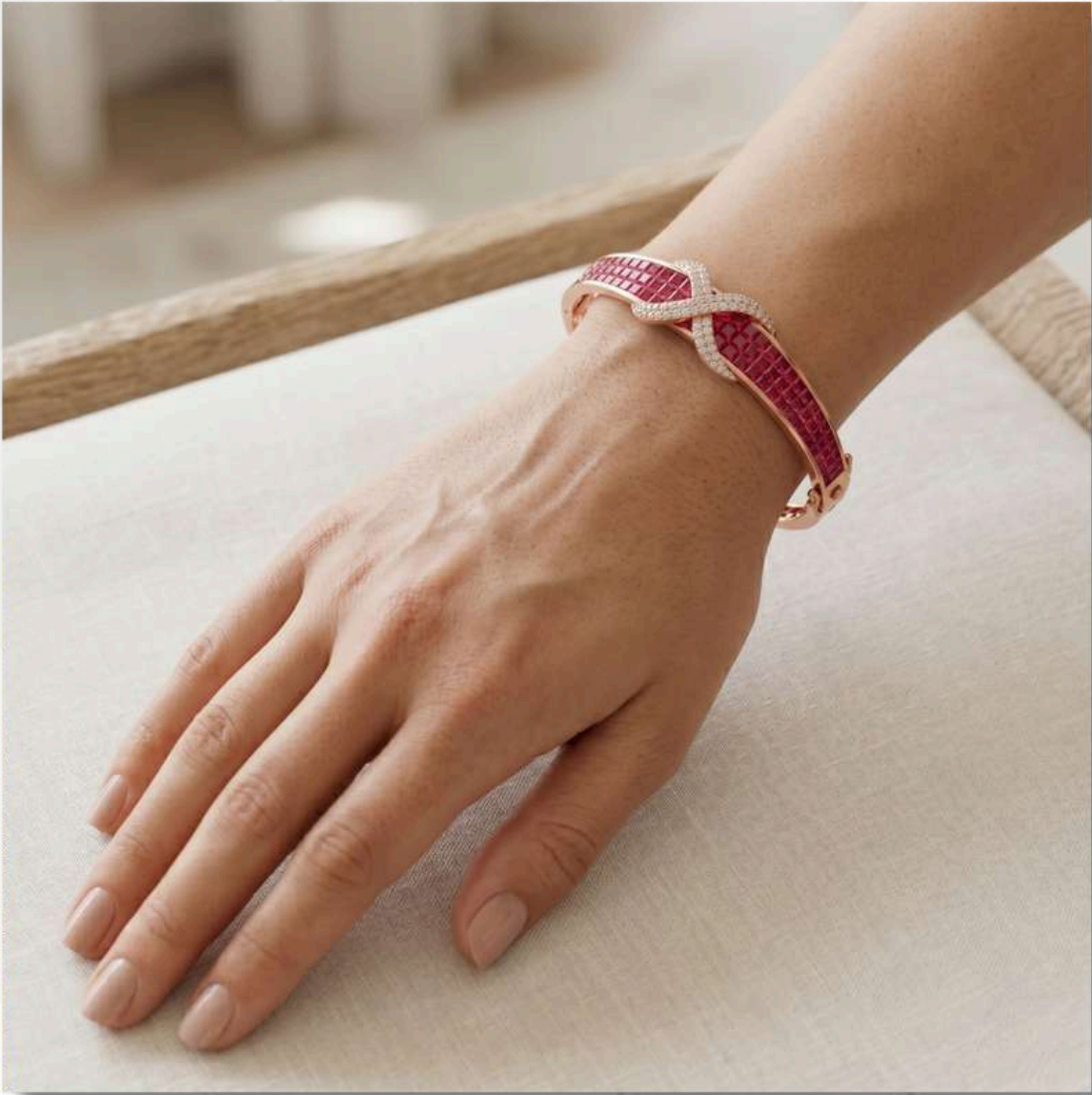
Style No. 70664