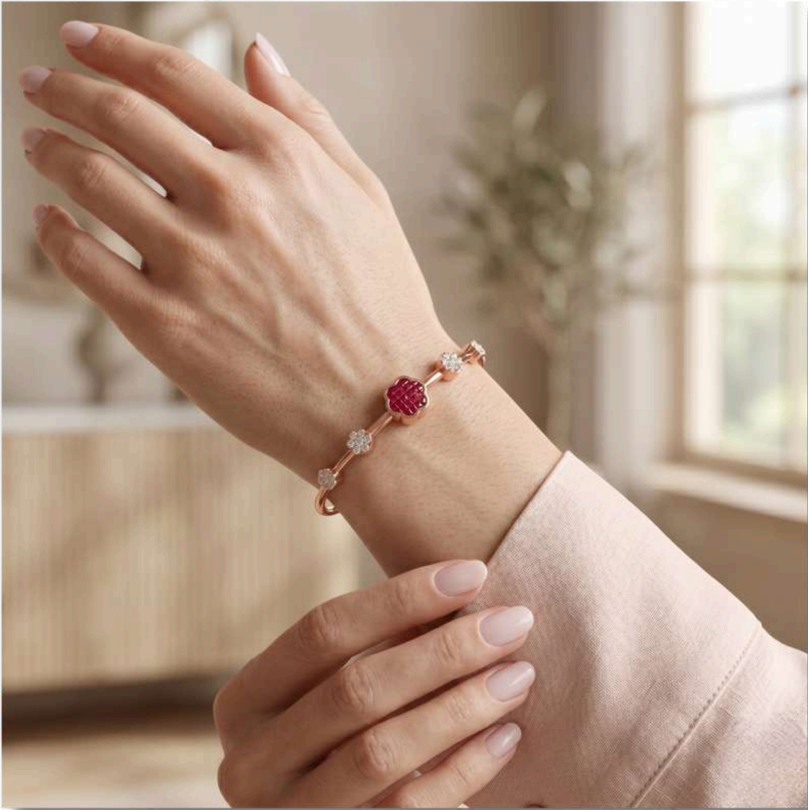
Style No. 70720