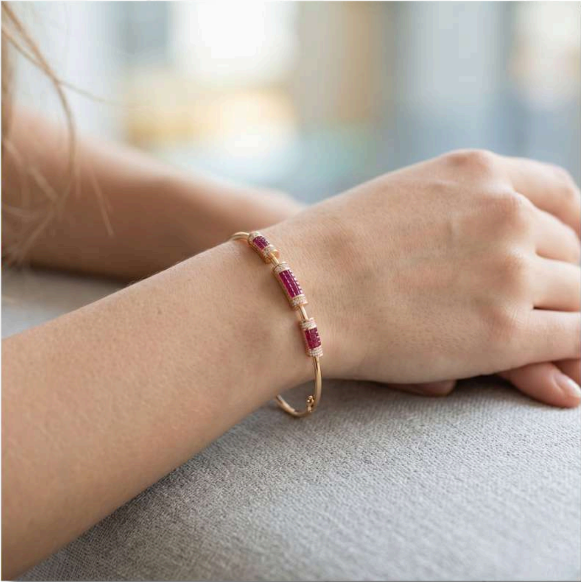
Style No. 70637