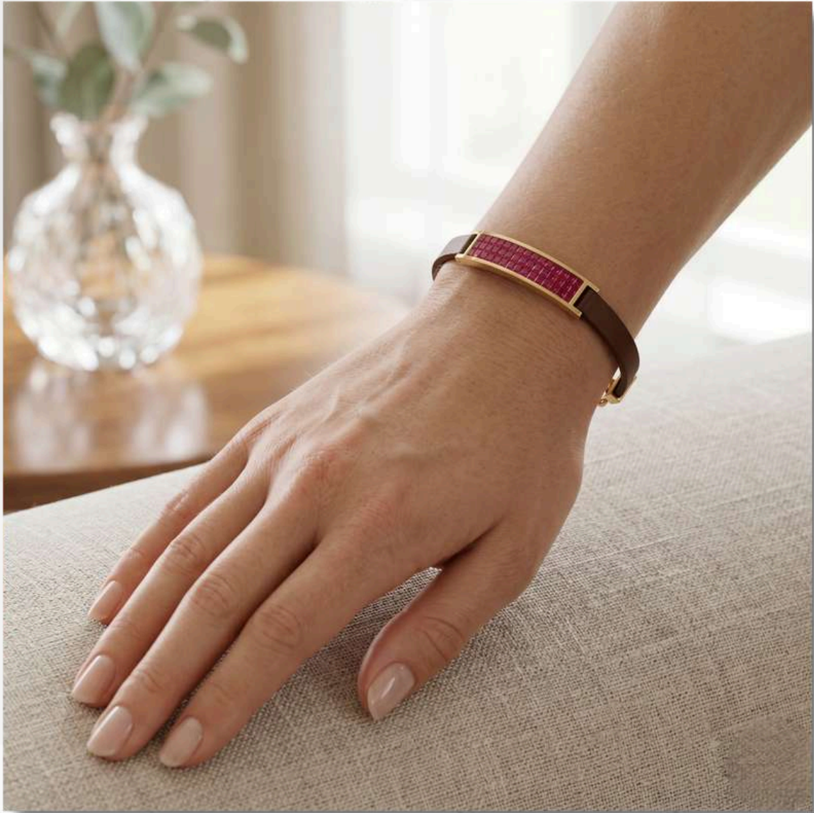
Style No. 70637